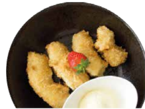
Banana Katsu V Served with salted caramel ice cream & chili toffee ginger sauce