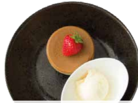
Steamed Sticky Toffee Sponge V With vanilla ice cream