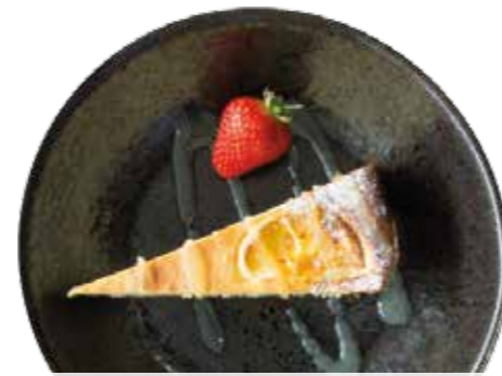
Baked Lemon & Ginger Cheesecake V