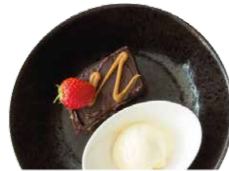
Salted Caramel Chocolate Brownie V Served hot with coconut ice cream