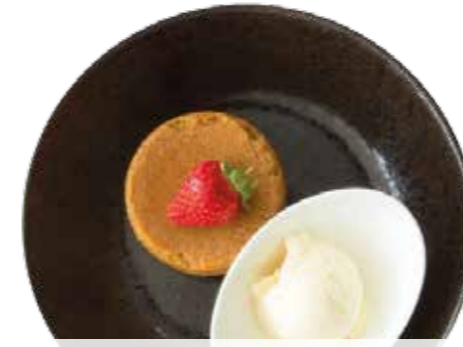
Steamed Treacle Sponge V With vanilla ice cream

PLEASE ASK A MEMBER OF STAFF FOR OUR TAKEAWAY MENU